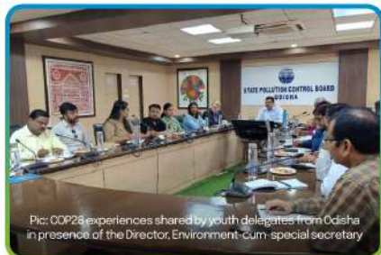
COP28 experiences shared by youth delegates from Odisha in presence of the Director, Environment cum special secretary

In a groundbreaking session on March 1, 2024, the Department of Environment, Forest, and Climate Change of the Government of Odisha, India, took significant strides towards a sustainable environment. The Youth4Water Plus campaign emerged as a key protagonist in the dialogue, amplifying the voices of five dynamic youth representatives who had served as ambassadors during COP28 in Dubai in the year of 2023. These representatives, from partner organizations like the Bakul Foundation, the Sattvic Soul Foundation, and the Youth for Sustainability Alliance, played a crucial role in shaping the narrative of the session.