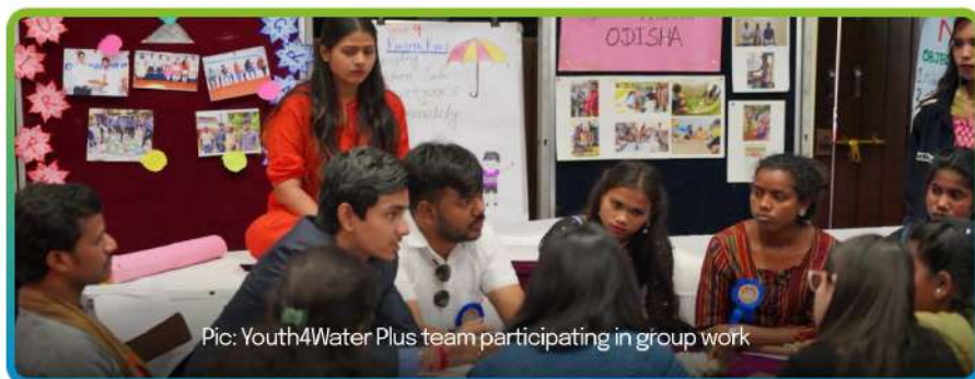
Pic: Youth4Water Plus team participating in group work

The stellar representation by the Youth4Water Plus champions during the fest resonated with pride and dedication. These young ambassadors enthusiastically and passionately conveyed their vision for a sustainable future, leaving an indelible mark on the audience. Their engagement in open panel discussions showcased their knowledge and demonstrated a collective determination to address challenges and drive positive change.