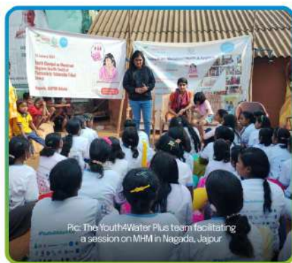
Pic: The Youth4Water Plus team facilitating a session on MHM in Nagada, Jajpur

Nagada village in Odisha, India, once grappling with malnutrition and poverty, has witnessed a transformative journey led by the Youth4Water Plus team. In 2023, they initiated a 'Youth Choupal' to raise awareness about climate change, and in 2024, they returned with a focused agenda on Menstrual Health and Hygiene, targeting the Particularly Vulnerable Tribal Group within the youth demographic.