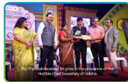
Pic: The Stall received 1st prize in the presence of the Hon'ble Chief Secretary of Odisha

At Sisir Saras Mela 2024, the Department of Panchayati Raj and Drinking Water Department (PR&DW), Govt. of Odisha, hosted a standout stall in collaboration with the Youth4Water Plus Campaign, winning the first prize in the IEC category. Running from January 6th to 15th, 2024, in Bhubaneswar, Odisha, the stall, backed by Youth4Water Plus & National Cadet Corps volunteers, was a vibrant hub for learning about Water, Sanitation, and Hygiene (WASH), climate, and the environment.