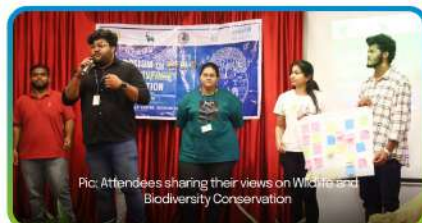
Pic: Attendees sharing their views on Wildlife and Biodiversity Conservation

The symposium had marked a significant milestone in the journey towards sustainable environmental practices, underlining the crucial role of youth in shaping a future we can all be proud of. Youth4Water Plus remains committed in fostering environmental awareness and collaborative efforts for a greener, healthier planet.