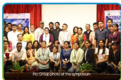
Pic: Group photo at the symposium

In a remarkable gathering, Youth4Water Plus brought together over 100 passionate young minds from diverse regions of Odisha for a one-day symposium on Wildlife and Biodiversity Conservation. The symposium aimed to foster collaboration, share knowledge, and ignite innovative ideas among the youth to address pressing environmental challenges. Held in collaboration with UNICEF, FORCE, Bikash Saathi, and the Regional Science Centre, Bhubaneswar, the symposium received significant support, creating a platform for meaningful discussions.