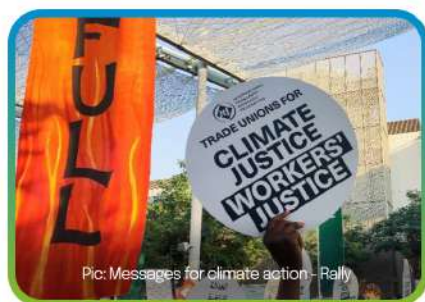
Pic: Messages for climate action - Rally

COP 28, or the 28th United Nations Climate Change Conference of the Parties, is an international gathering where representatives from nearly 200 countries come together to discuss and negotiate global climate policies and actions. The conference was held from 30 November until 12 December 2023 in Dubai, United Arab Emirates.